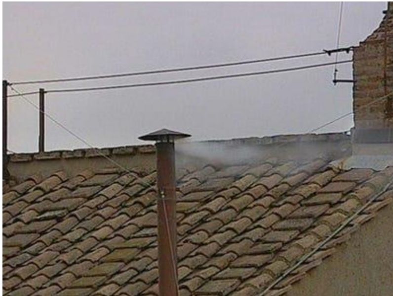
White smoke emerging from the chimney on the roof of the Sistine Chapel